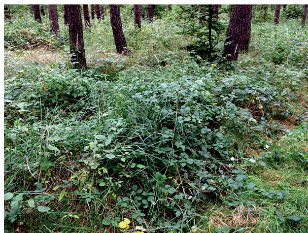
Fig. 4. Rubus lindebergii in the undergrowth of post-agricultural pine monoculture (4.09.2013, in the vicinity of Sosny village,)