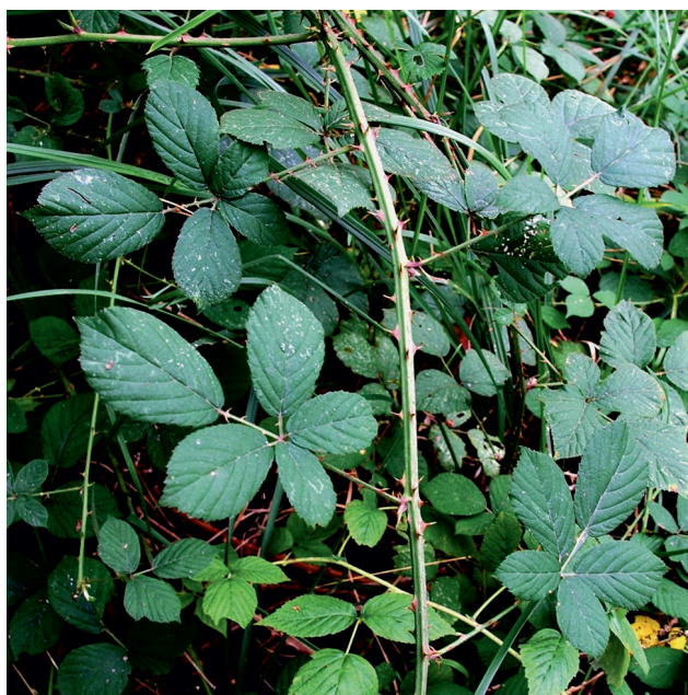
Fig. 2. Rubus lindebergii – fragment of vegetative stem (4.09.2013, in the vicinity of Sosny village,)