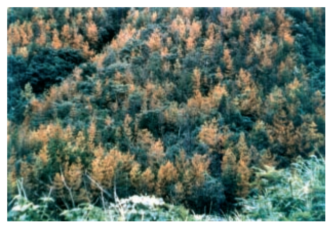
Fig. 1. Actual damage of the Japanese red pine forest by pine wilt disease