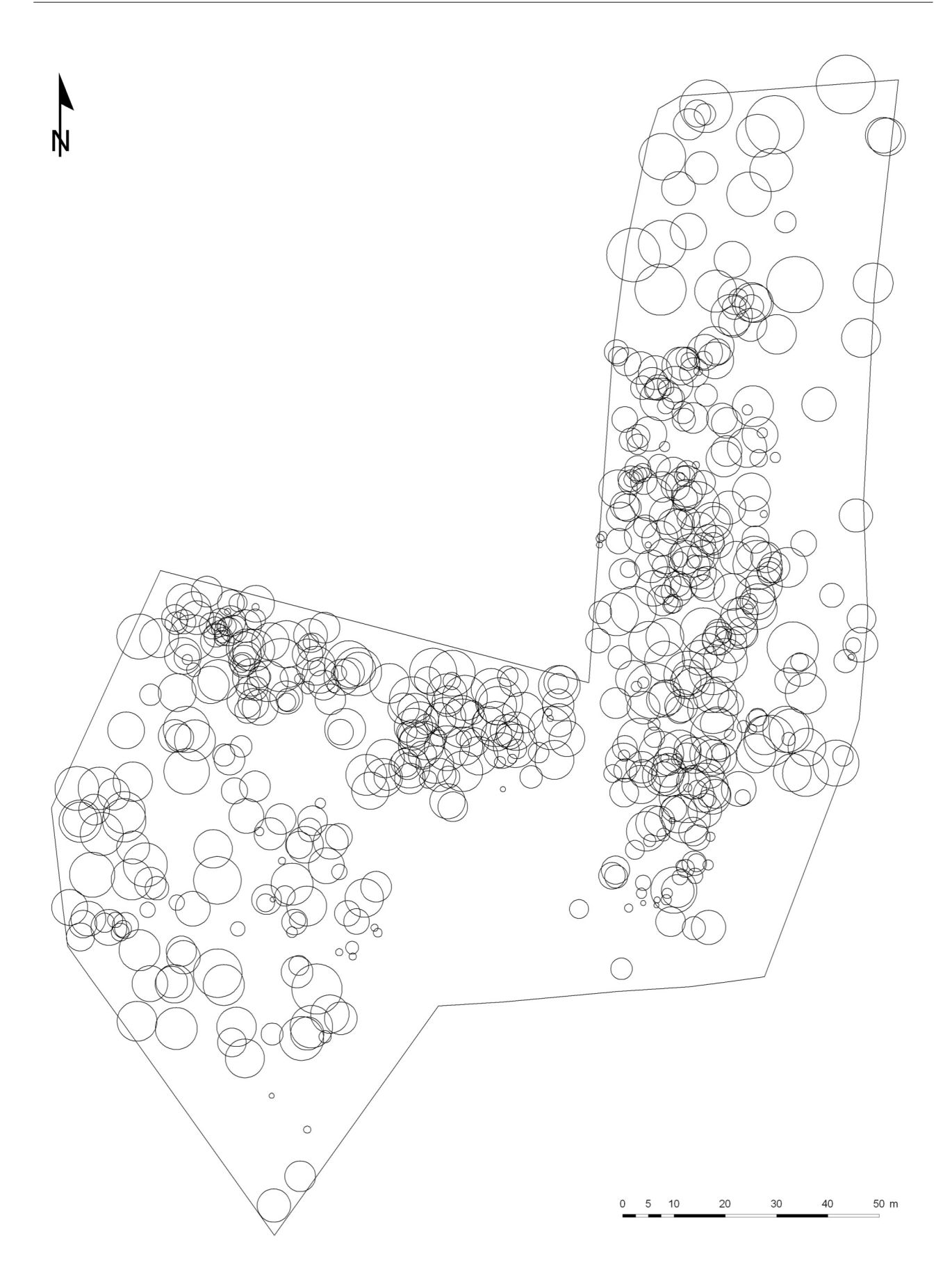
Fig. 1. Spatial structure of Sorbus torminalis population; circles show crown projections